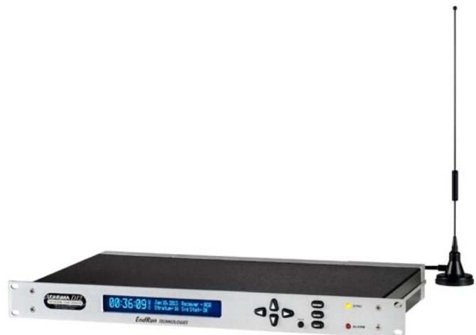
CDMA antenna with 12 feet of cable easily installs on top of your equipment rack.

www.endruntechnologies.com/guarantee.htm