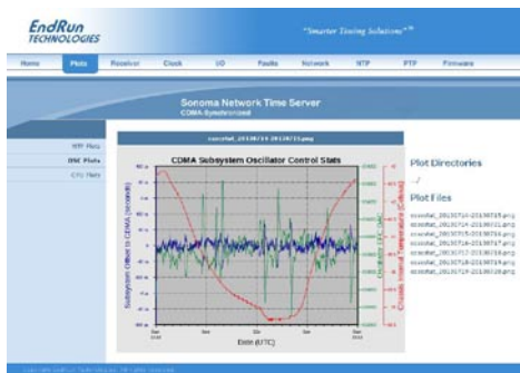
Charts available for NTP, Oscillator and CPU statistics

The tabbed panels offer easy access to information about the Receiver, Clock, I/O, Faults, NTP, PTP and the Firmware. Firmware upgrades are easy with the point & click upgrade process. Also, a link to the resident User Manual is available on the Home page.