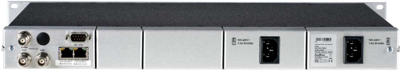
Sonoma rear panel with optional dual power supplies. Antenna input TNC connector on upper left. Two spare BNC connectors on lower left. One RS-232 connector. Two 10/100/1000 Base-T Ethernet ports. Optional dual power supply connectors on right.