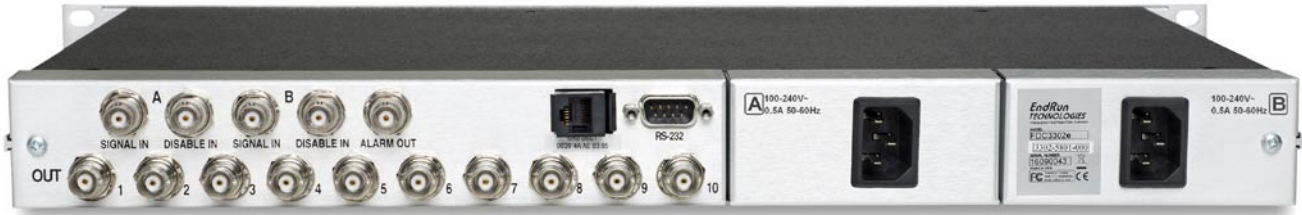
FDC3302e rear panel view. Shown with optional dual power supplies.