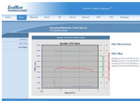
Charts available for NTP, Oscillator and CPU statistics

The tabbed panels offer easy access to information about the Receiver, Clock, I/O, Faults, NTP, PTP and the Firmware. Firmware upgrades are easy with the point & click upgrade process. Also, a link to the resident User Manual is available on the Home page.