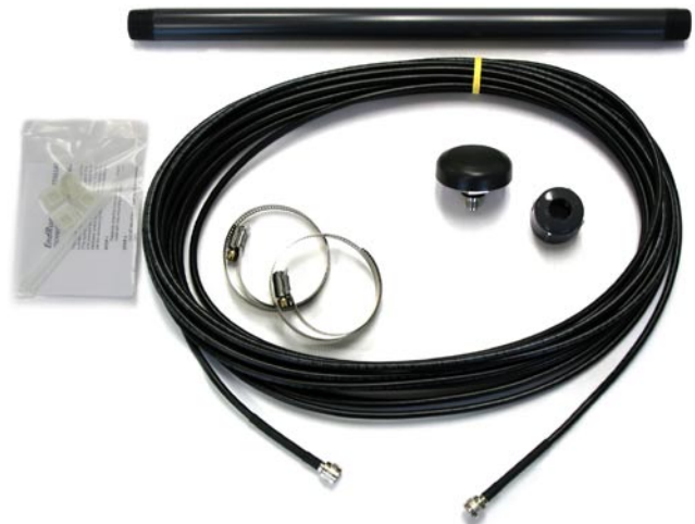
GPS Antenna Kit included free. Mounting pipe, ring clamps, 50 ft (15m) cable, antenna & adapter In plastic bag: window mount kit & instructions.

www.endruntechnologies.com/guarantee.htm